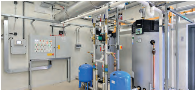
Diana Princess of Wales Hospital (Grimsby) Read more >