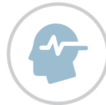
Mental health facilities