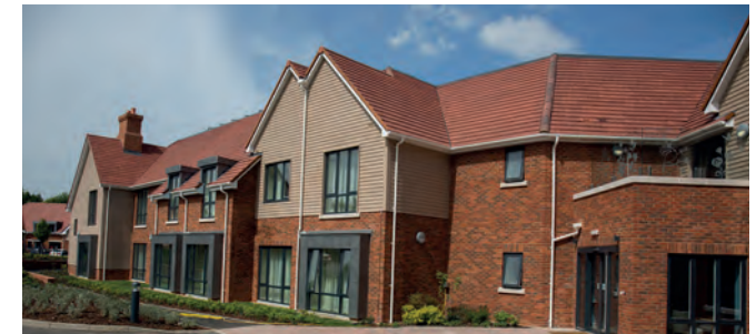
Bupa Goldbridge Care Home (Sussex) Read more >