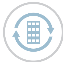
Change of use