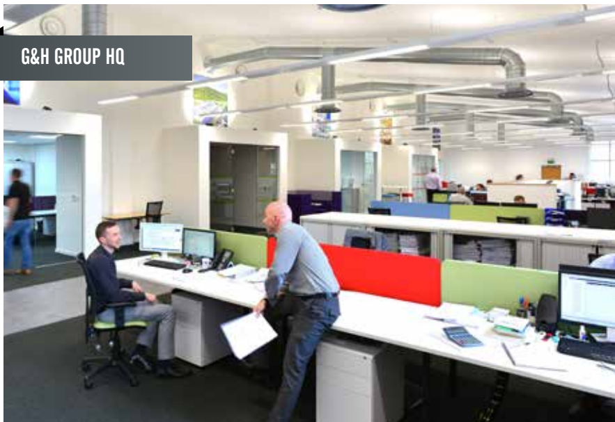
G&H GROUP HQ