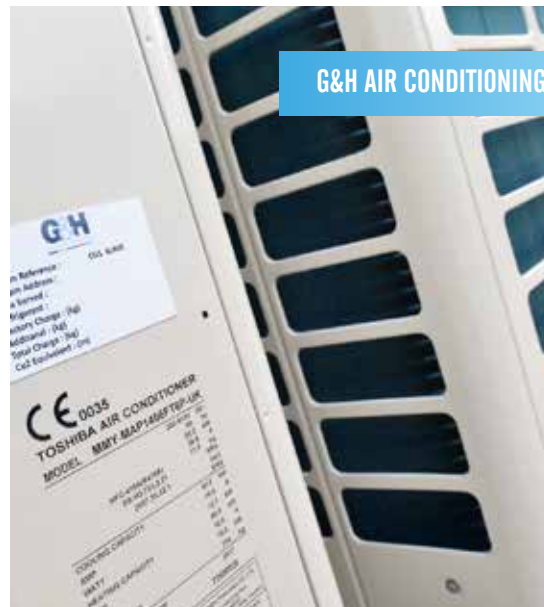
G&H AIR CONDITIONING