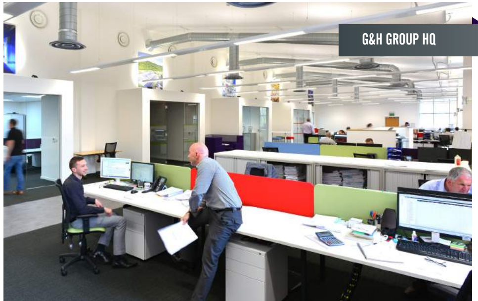
G&H GROUP HQ